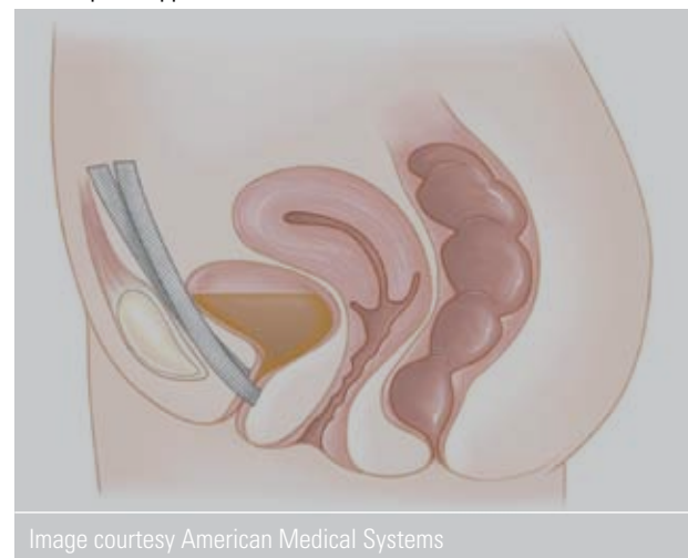
Figure 2. Demonstration of midurethral sling placed via a retropubic approach

Stress urinary incontinence can be treated with colposuspension, pubovaginal sling with rectus fascia or midurethral tapes. There are various midurethral tape kits available using a retropubic or transobturator route. These slings aim to reduce bladder neck hypermobility (Figure 2). Periuretheral bulking agents may also be used and work well for some patients.