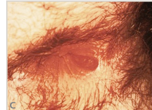
Syphilitic ulcer, perianal