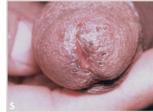
Crusted syphilitic ulcer, urethra