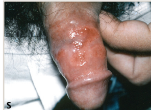
Multiple syphilitic ulcers, glans