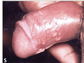
Multiple syphilitic ulcers resembling herpes