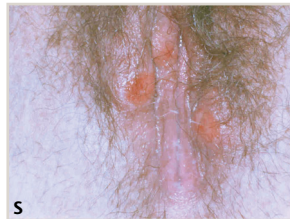
Multiple syphilitic ulcers, vulva