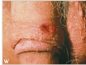
Syphilitic ulcer, glans